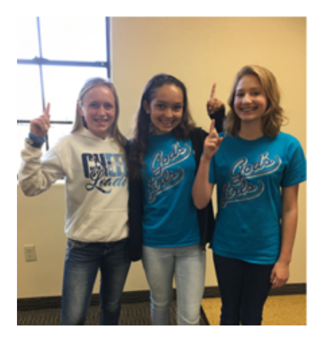
God's Girls Give Him Glory At Chapel