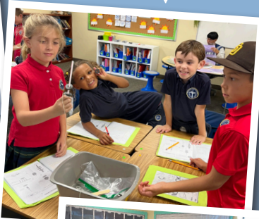
TK students learning about fossils.