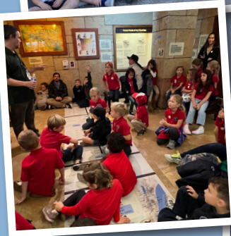
First grade field trip to the Creation Museum.