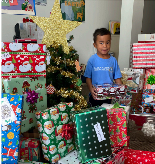
Blessing Boxes for our local homeless children.

Each one of our preschool students is a sweet blessing to our school. We have watched them grow and learn over the past few months and now we are watching them bless others. Our annual Blessing Box program allows our families to fill the hearts of the homeless with Christ's love. The children filled the boxes with basic necessity items, small toys and candy. The boxes will be distributed to local families in need by the Hope in the Streets ministry team from Maranatha Chapel.