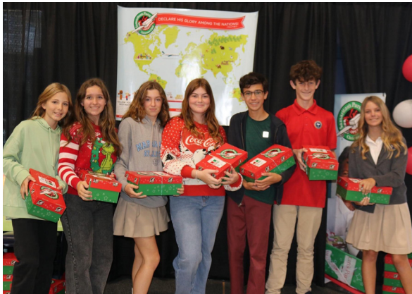
Junior high students helped to pack hundreds of Operation Christmas Child boxes.