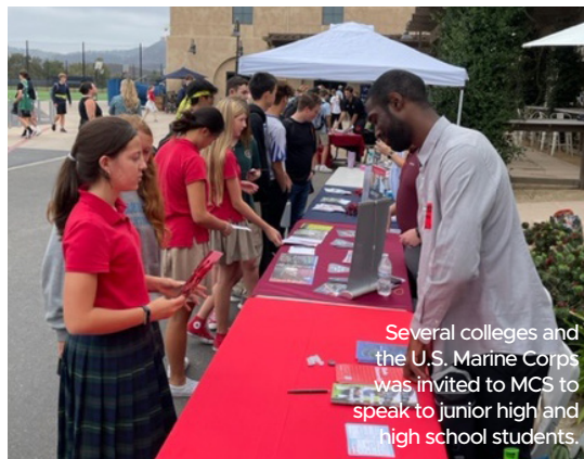
Several colleges and the U.S. Marine Corps was invited to MCS to speak to junior high and high school students.