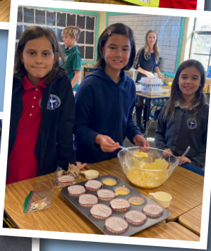
Fifth grade students baking cornbread.