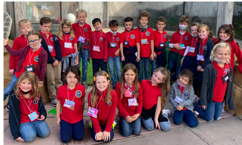
FIRST GRADE AT THE LIVING COAST DISCOVERY CENTER