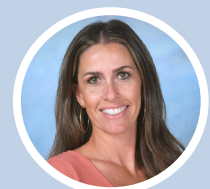
CASSIE PIZARRO Art