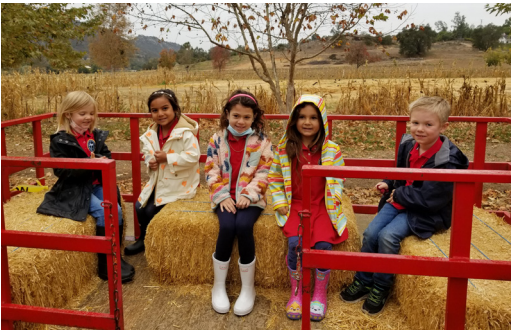
TK AT BATES NUT FARM