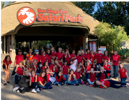
THIRD GRADE AT THE SAN DIEGO ZOO SAFARI PARK