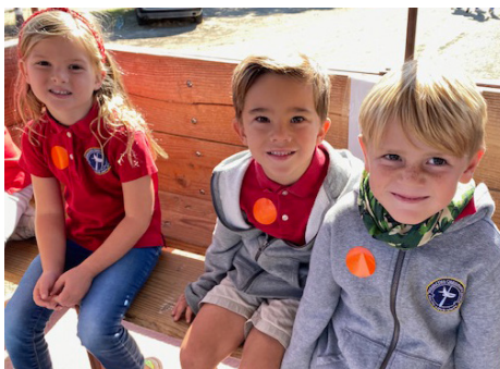
KINDERGARTEN AT OMA'S PUMPKIN PATCH