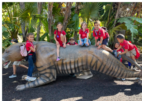
SECOND GRADE AT THE ZOO