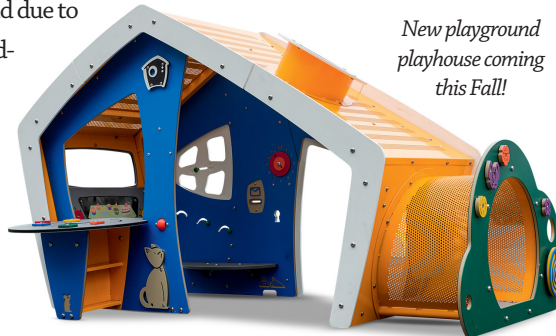
New playground playhouse coming this Fall!

We are giving the glory to God! With grateful and humble hearts, we wanted to report that this year's "Trike-a-Thon" was a total success. Due to the generosity of our families, we raised a record breaking $12,000!! With these funds, and due to the fact that our preschoolers are spending more time outside, we are going to purchase a new playhouse for our playground. Grant money will pay for the installation. Thank you to our families and parent volunteers who made the "Trike-a-Thon" extra special this year.