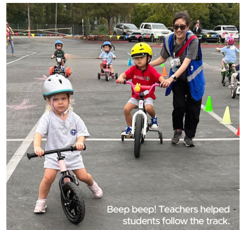
Beep beep! Teachers helped students follow the track.