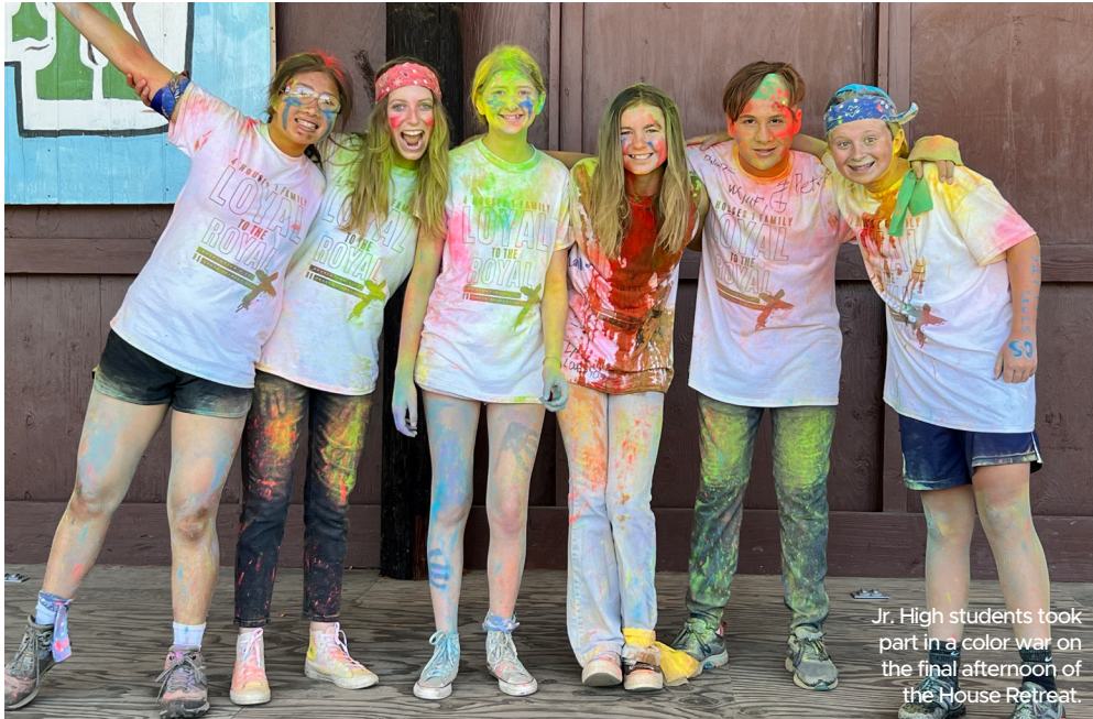
Jr. High students took part in a color war on the final afternoon of the House Retreat.