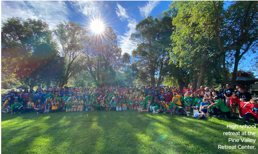
High school retreat at the Pine Valley Retreat Center.