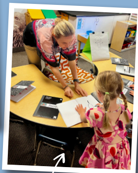
Back to School Night fun!