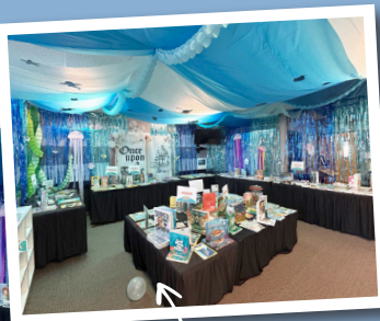
Students purchased books from our I:55 Book Fair.