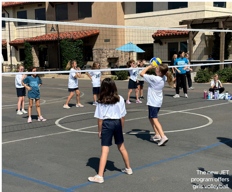
The new JET program offers girls volleyball.