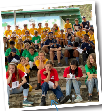
Worship and reflection at the Jr. High House Retreat.