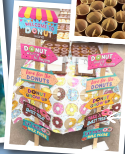
Delicious donuts for the Jr. High Snack Attack.