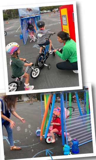
Fueling up then through the bike wash before heading to the starting line.

Did you stop by our first I:55 Book Fair? MCS partnered with this family owned company to offer a new selection of children's books. This specialized book fair allowed our students to purchase books that were pre-screened to make sure the content adheres to biblical principles and values.